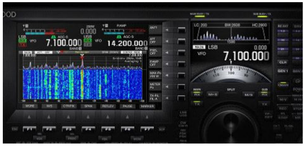
Dual TFT display

Located on the front panel is the world's first1 dual TFT display, enhancing both visibility and operating ease.